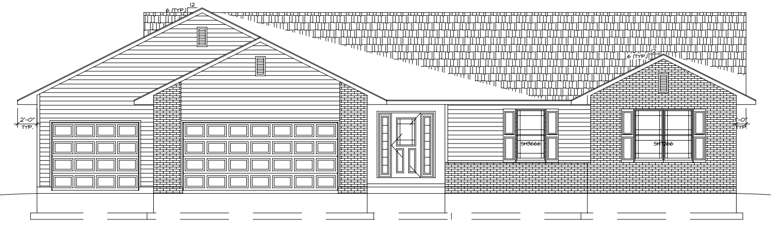
FRONT ELEVATION A-1 SCALE: 1/4"=1'-0"